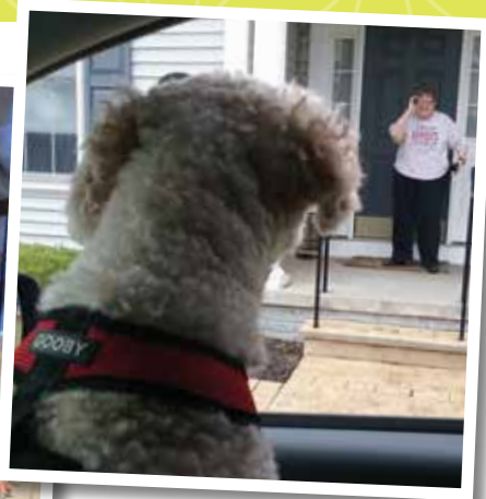
Steelers still brought comfort and joy through drive-by visits and tail wags through the window.