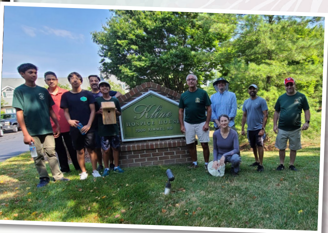
Boy Scout Troop 470