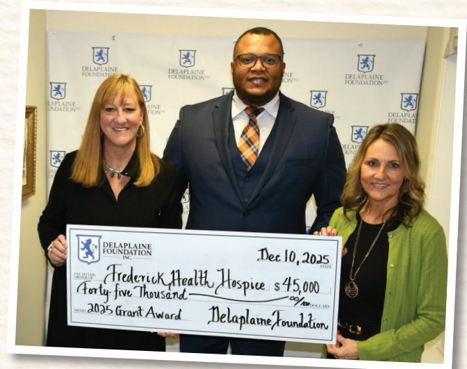
The Delaplaine Foundation provided a generous grant to support our Music Therapy program.